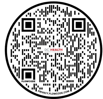
Rodent and Vector Control Division Website